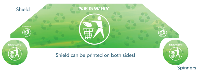
Trash Bin / mop/up4™